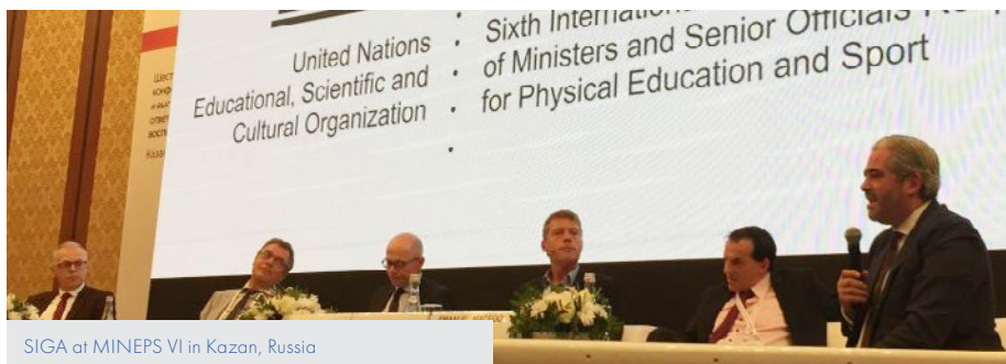
SIGA at MINEPS VI in Kazan, Russia

reinforced their commitment to place sport integrity at the top of their political agenda and support the implementation of the Kazan Action Plan, adopted at MINEPS VI.