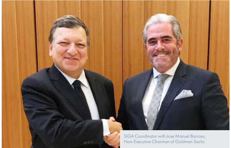
SIGA Coordinator with Jose Manuel Barroso, Non-Executive Chairman of Goldman Sachs

José Manuel Barroso was President of the European Commission (2004-2014), and Prime Minister of Portugal (2002-2004) and Minister of Foreign Affairs before that.