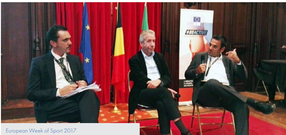
European Week of Sport 2017

through SIGA's social media channels to promote both sports to a wider audience. Further initiatives were forthcoming from other SIGA Supporters including the Benfica Foundation, Cyprus Sport Organisation, ICSS INSIGHT, National Olympic Committee of Portugal and Special Olympics.