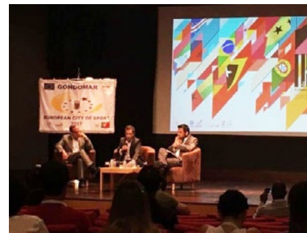
The 2nd Forum of Sport of the Community of Portuguese Speaking Countries (CPLP) in Gondomar, Portugal