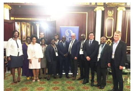
SIGA at MINEPS VI in Kazan, Russia

The meeting was very productive and led the way to a series of concerted initiatives that would be carried out over the following few months. Joining SIGA and UNESCO were representatives of the Community of Portuguese Language Countries (CPLP), Ministers, Secretaries of State and other senior government representatives from the Dominican Republic, Greece, Angola, Portugal, Senegal, Mali, Guinea-Bissau, Mozambique, Kenya and the Central-African Republic. They all