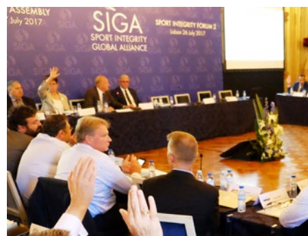
SIGA General Assembly 27 July 2017 in Lisbon

the terms of reference of the SIGA Standing Committees, SIGA Code of Ethics, SIGA Gift & Entertainment Policy, SIGA Conflicts of Interest Policy, SIGA Anti-Bribery and Anti-Corruption Policy, and SIGA Electoral Regulations. Two new Standing Committees were also created: the Sponsorship, Media & Sport Integrity Committee and the Youth Development and Protection Committee. These policies and regulations form SIGA's internal governance system.