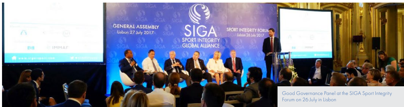
Good Governance Panel at the SIGA Sport Integrity Forum on 26 July in Lisbon