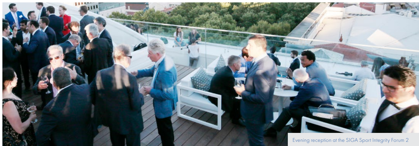
Evening reception at the SIGA Sport Integrity Forum 2