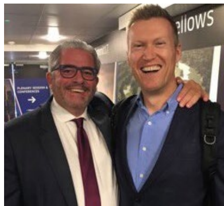
SIGA at Leaders in Sport Conference on 5 October 2017 in London