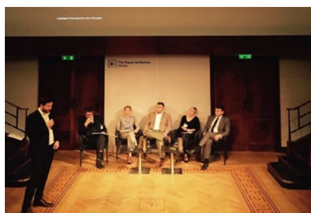
Law in Sport 2017 Conference