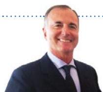
Franco Frattini SIGA Chairman

I am delighted and honoured to have been elected as SIGA's first independent Chair. I strongly support SIGA's activities to reform sport and am proud to be part of this process.