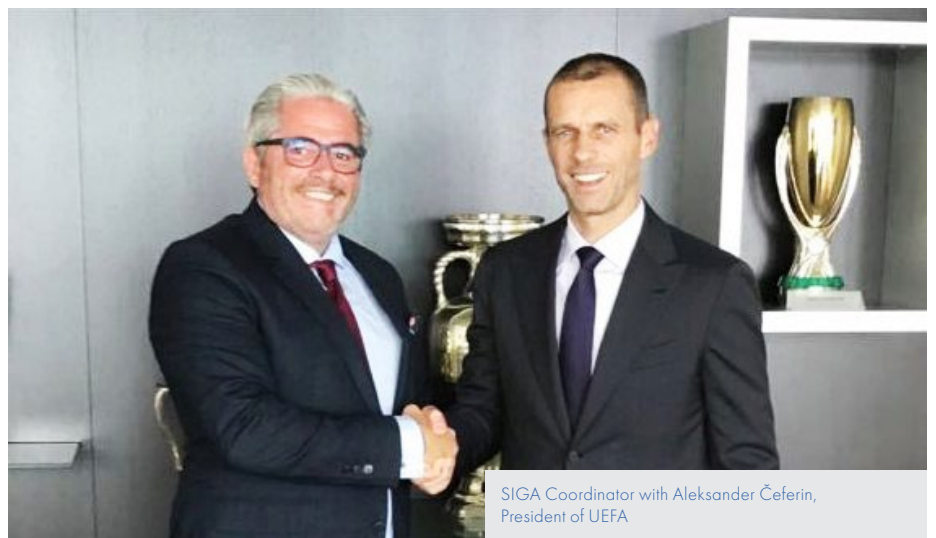
SIGA Coordinator with Aleksander Čeferin, President of UEFA

Held in a spirit of mutual respect, the meeting heralded the start of a close dialogue at the highest level and constructive cooperation between the European football's governing body and SIGA on matters of common concern, including financial integrity and transparency in football, sports betting integrity, youth protection and sports governance.