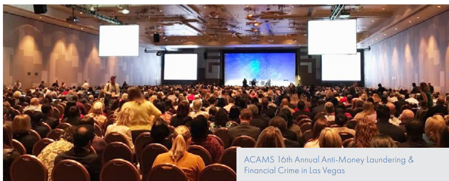
ACAMS 16th Annual Anti-Money Laundering & Financial Crime in Las Vegas