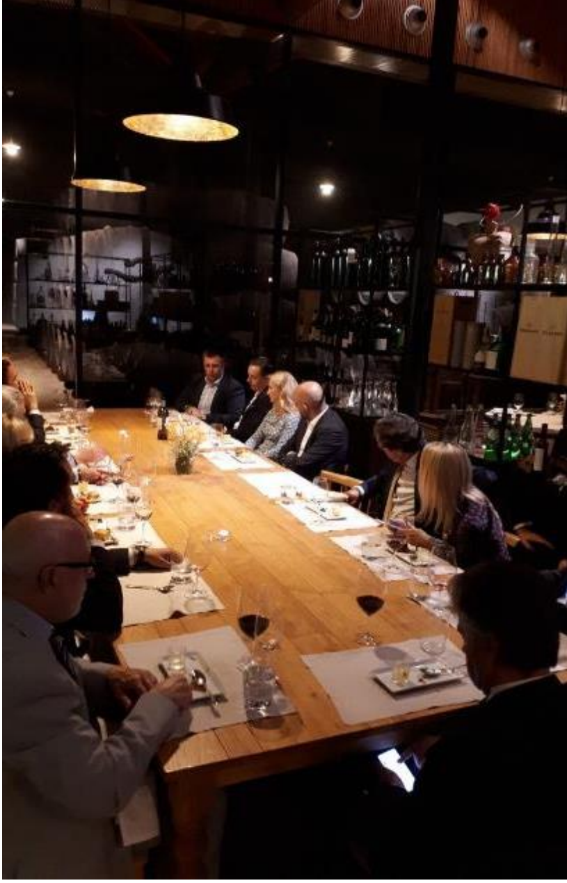
Porto, 7 May 2018