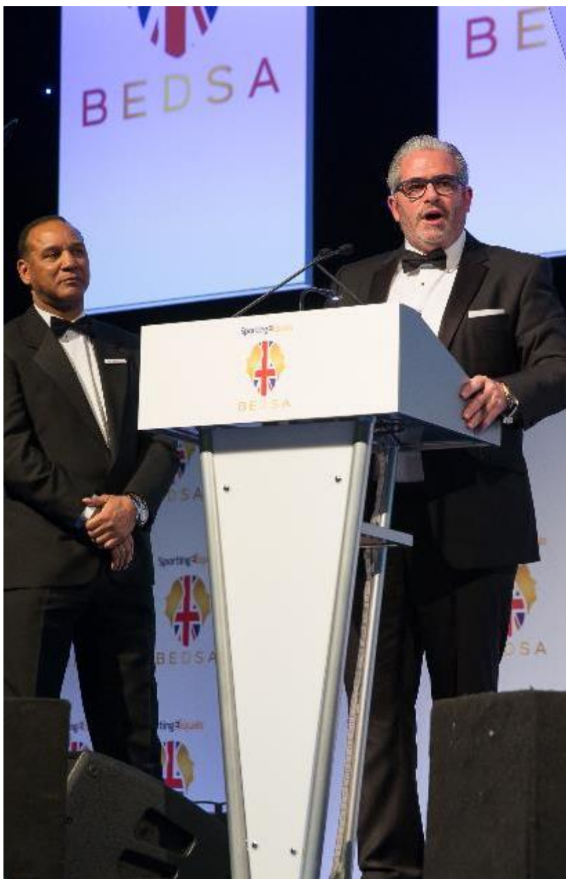
London, 24 March 2018