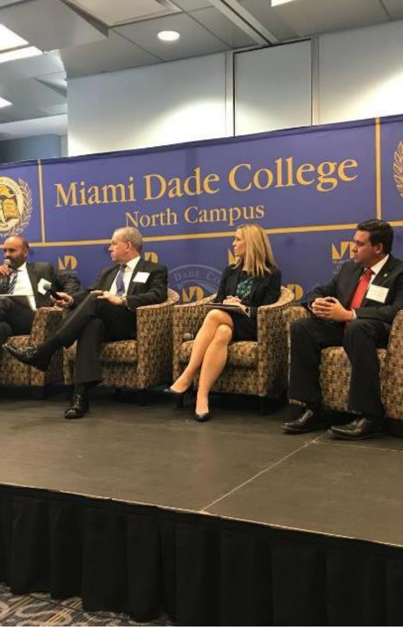
Miami, 26 April 2018