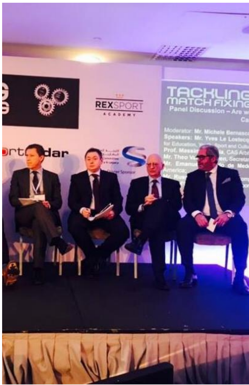
London, 10 March 2018