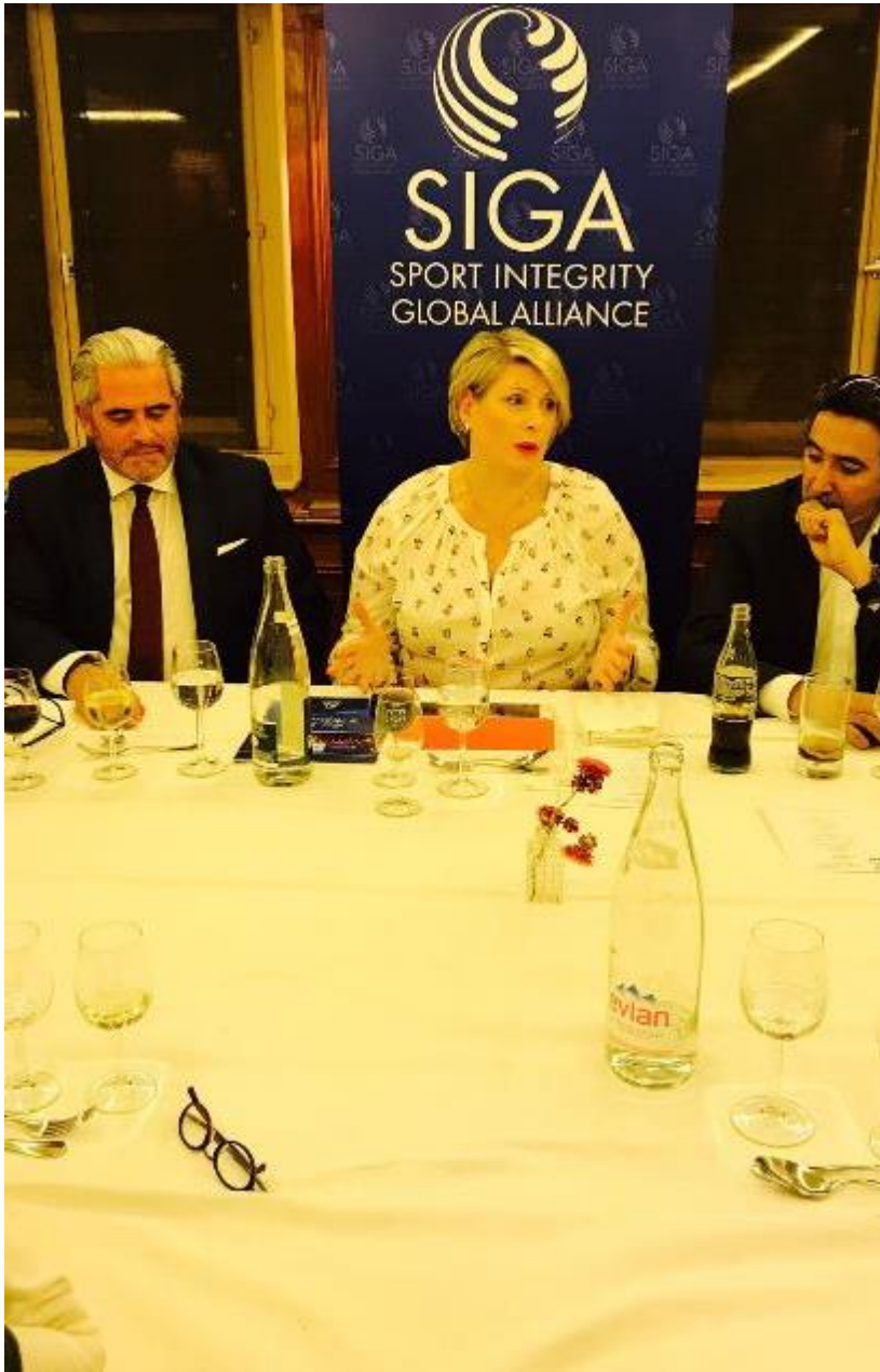
Paris, 26 March 2018