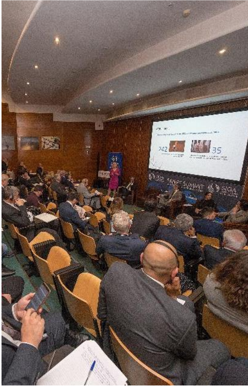
Porto, 8 May 2018