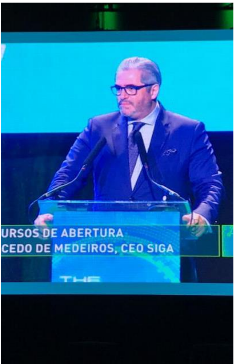
Lisbon, 21 March 2018