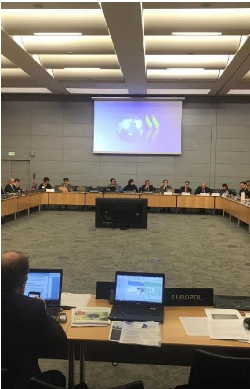
Paris, 16 March 2018