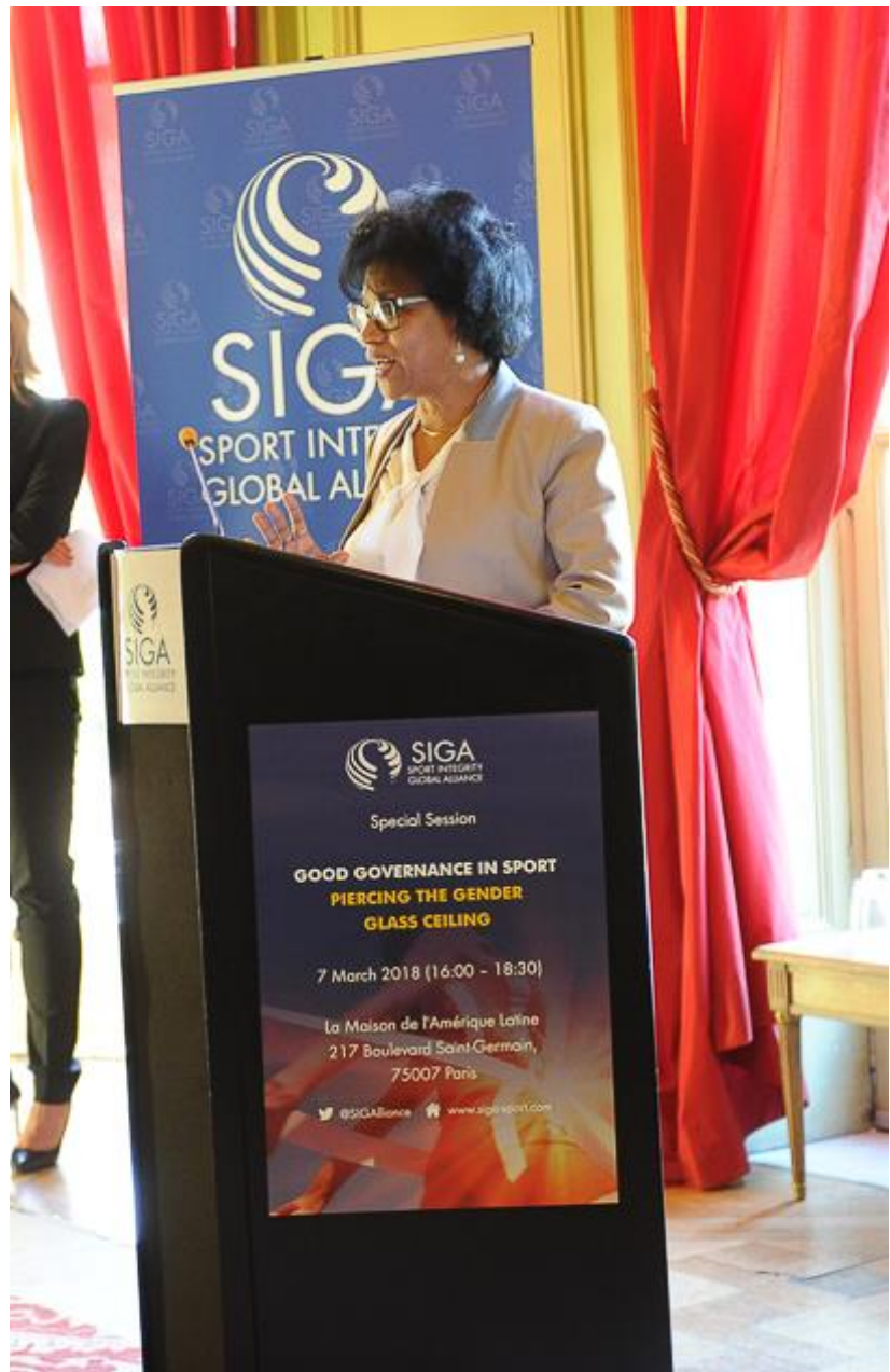
Paris, 7 March 2018