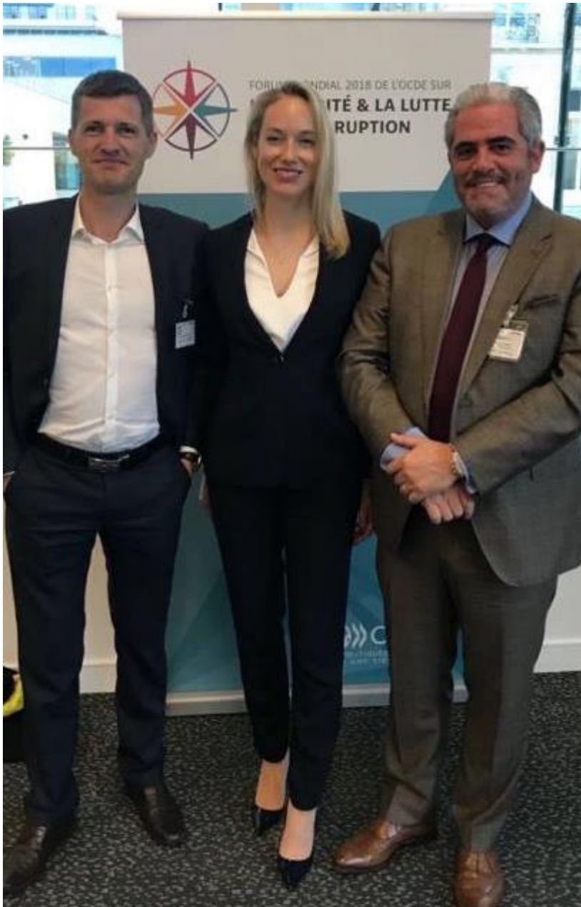
Paris, 27-28 March 2018