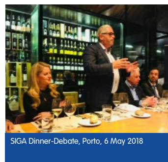
SIGA Dinner-Debate, Porto, 6 May 2018