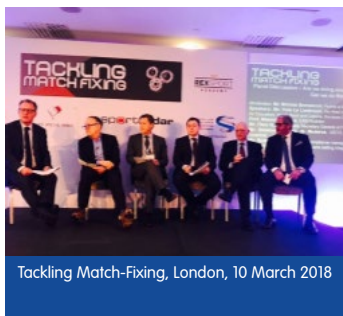
Tackling Match-Fixing, London, 10 March 2018