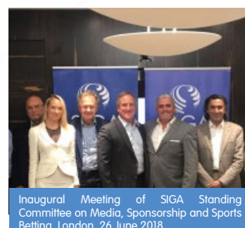
Inaugural Meeting of SIGA Standing Committee on Media, Sponsorship and Sports Betting, London, 26 June 2018

To read the full 100 Days Report, please visit http://siga-sport.net/siga-first-100-days/