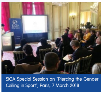
SIGA Special Session on "Piercing the Gender Ceiling in Sport", Paris, 7 March 2018