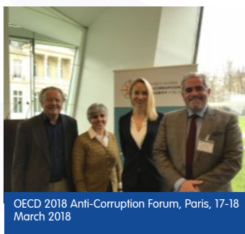
OECD 2018 Anti-Corruption Forum, Paris, 17-18 March 2018