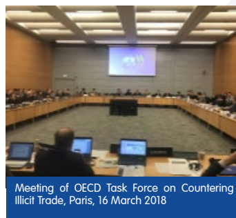
Meeting of OECD Task Force on Countering Illicit Trade, Paris, 16 March 2018