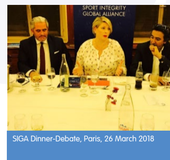
SIGA Dinner-Debate, Paris, 26 March 2018