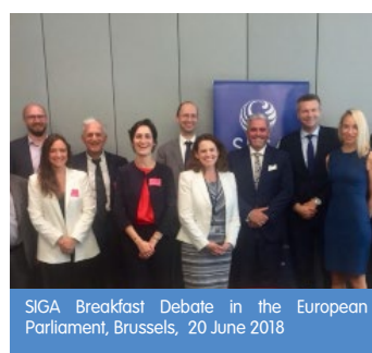
SIGA Breakfast Debate in the European Parliament, Brussels, 20 June 2018