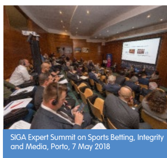
SIGA Expert Summit on Sports Betting, Integrity and Media, Porto, 7 May 2018