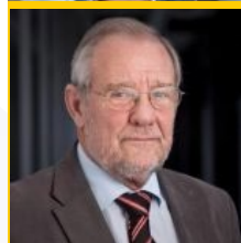
Richard Caborn, Sports Consultant, Quest and former UK Sport Minister