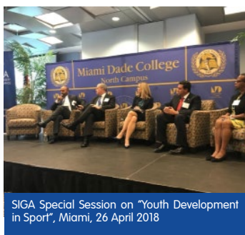
SIGA Special Session on "Youth Development in Sport", Miami, 26 April 2018