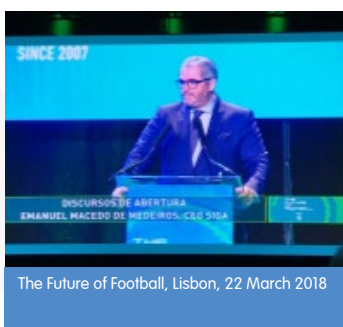
The Future of Football, Lisbon, 22 March 2018