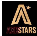
Louis Saha SIGA Champion; International Football Legend; Founder & CEO AxisStars

We have seen over the years the words transparency and integrity have meaning, but there is no real action. SIGA is correctly trying to rectify that, so I felt it was my duty to contribute. We need to change the mentality and I feel like as I'm starting individually as an entrepreneur it made sense to partner with SIGA.