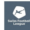
OLIVER WIRZ COO/CFO, SWISS FOOTBALL LEAGUE