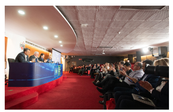
Sport Integrity Forum Latin America, São Paulo, Brazil