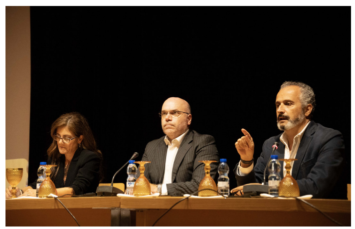
Esports Integrity Forum, Pombal, Portugal