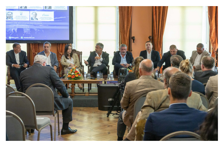
Integrity in Sport: The (New) challenges, Porto, Portugal