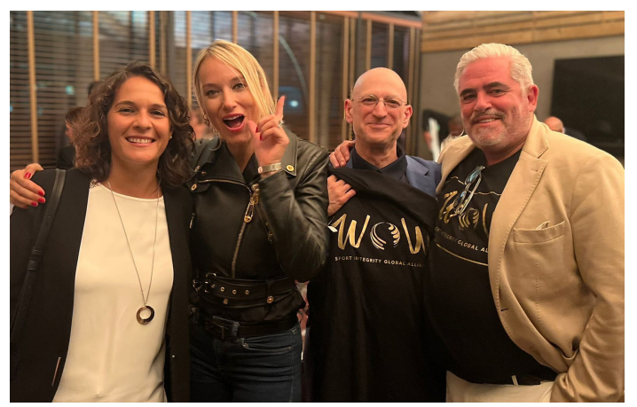
SIGAWoW Dinner Debate, Porto, Portugal