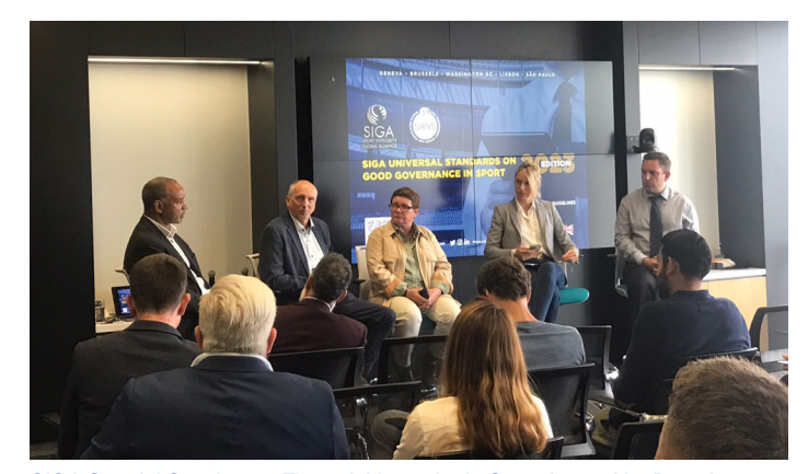
SIGA Special Session on Financial Integrity in Sport hosted by Dow Jones, London, UK