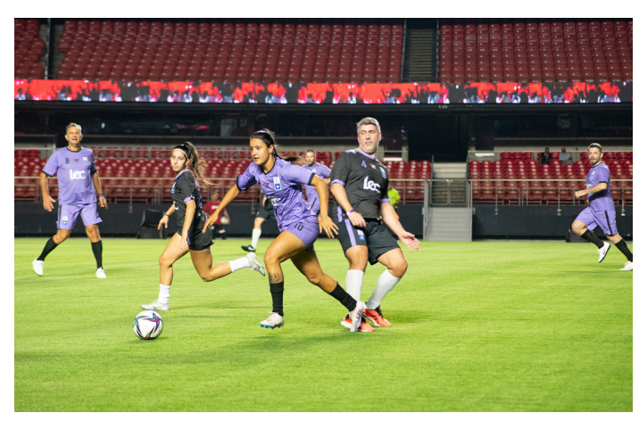
Integrity Match, hosted by São Paulo, Brazil