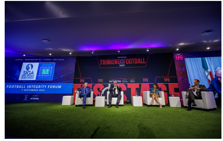
Football Integrity Forum, Porto, Portugal