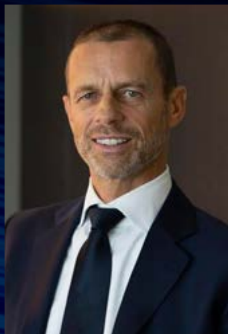
Aleksander Ceferin President, UEFA

The establishment of the Sport Integrity Global Alliance in Switzerland, seven years ago, has played a significant role in protecting integrity in sports. Since its inception SIGA has been committed to promoting reforms and setting standards in this field. UEFA signed a cooperation agreement with SIGA in 2019 to encourage collaboration and an exchange of ideas to further support the long-term integrity of sports in Europe. This agreement leverages each organisation's strengths to instil high standards, including good governance, integrity, ethics and youth protection in football. Our collaboration has helped to create