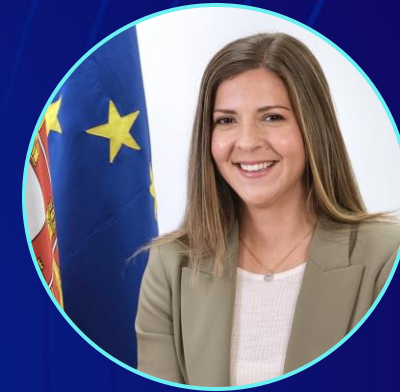
Margarida Balseiro Lopes

Minister, Youth and Modernization, Government of Portugal