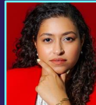
↘ Amna Al Haddad EMIRATI WEIGHTLIFTER AND ATHLETE