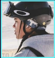
↘ Amenah AlMuhairi (Moon) EMIRATI SNOWBOARDING TRAILBLAZER