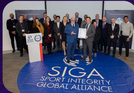
↳ European Rugby League Silver Certification November 2021