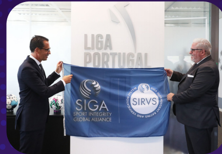
↳ Liga Portugal Bronze Certification August 2023