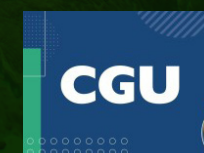
VINICIUS MARQUES DE CARVALHO

Brazil's Minister of State for the Comptroller General's Office